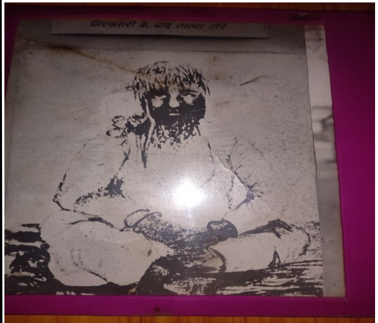
Amar Shaheed Tatya Tope In British military court after his arrest, picture has been kept in Municipal corporation museum Gwalior

1857 rebellion was the century changing incident which kept on the rising flames on the heart of whole Indian people. Tatya Tope was real martyr who beloved his mother land and sacrificed his life. It should be matter of discussion of history expert. Where most of the country person known that Tatya was martyr on the Indian first rebellion in 1857 and keep on his related evidence in corporation museum Gwalior M.P. But on the other hand Tatya's relatives has strong proof which presenting of his living after 1857 rebellion and he was died to normal death in 1909. Expert should be examine his old and new related evidence which can give us trustable and reliable facts about martyr Tatya Tope's life. Mena while history should be revive.